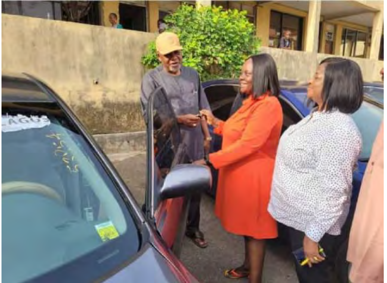
Beneficiaries of state palliative in Ayobo-Ipaja